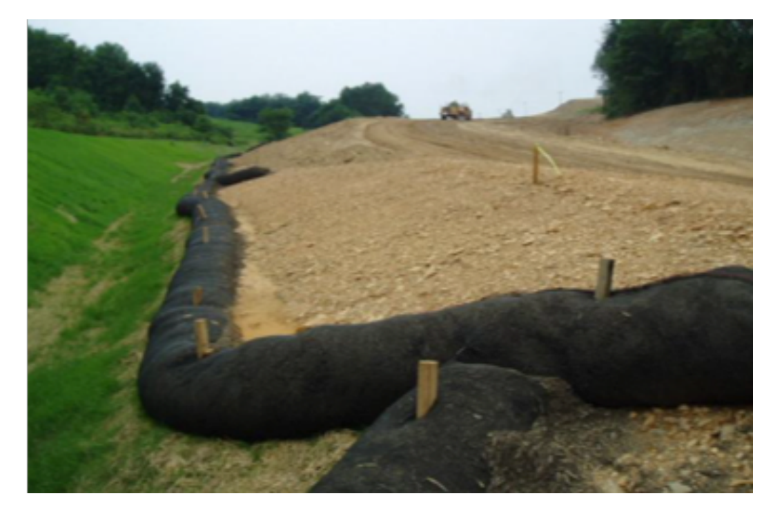
Compost and Compost Filter Sock Used for Soil and Sediment Erosion Control. Images from PennDEP. (2012). Erosion and Sediment Pollution Control Program Manual.